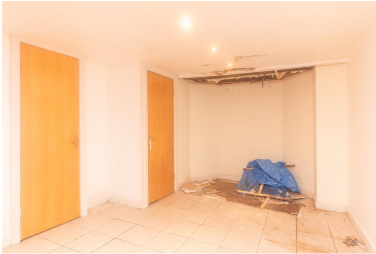
15' 4" x 10' 2" (4.67m x 3.1m)