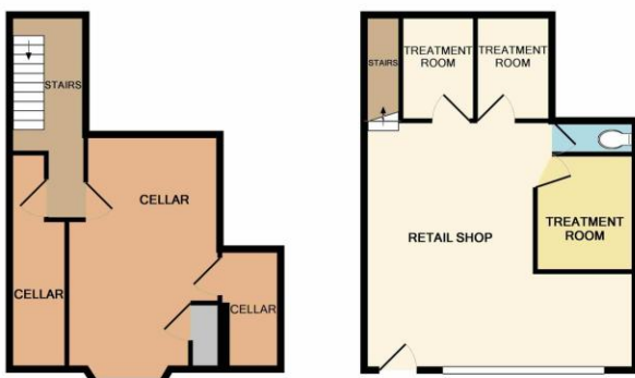
BASEMENT LEVEL APPROX. FLOOR AREA 296 SQ.FT. (27.5 SQ.M.)