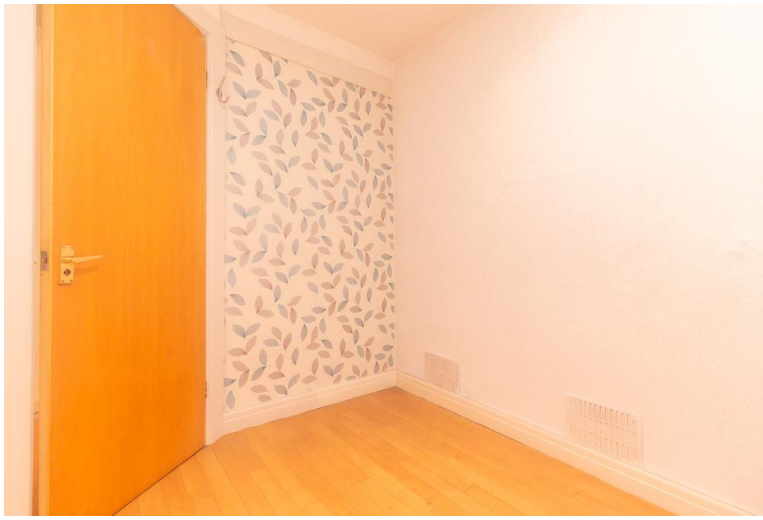
TREATMENT ROOM 7' 0" x 5' 0" (2.13m x 1.52m)